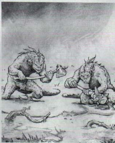
Scaly death awaits you in one of these adventures. Which? Order and find out!